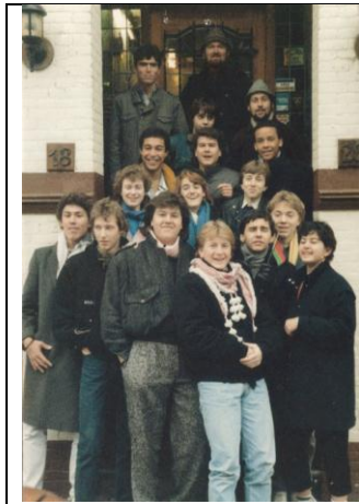
Left: The Hague - January 1986