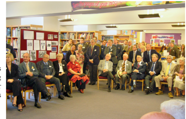
Pictured right: O.R.s in Library awaiting Address by Headmaster and presentations