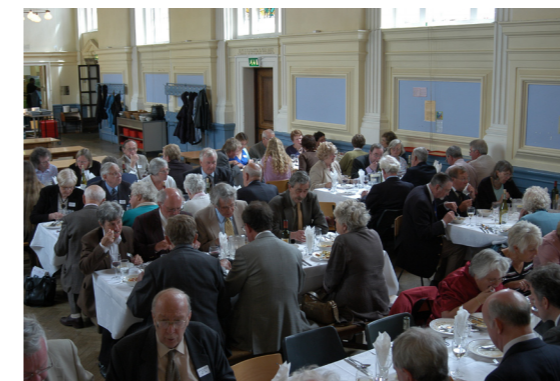
Pictured left: O.R.s enjoying lunch in the Dining Hall