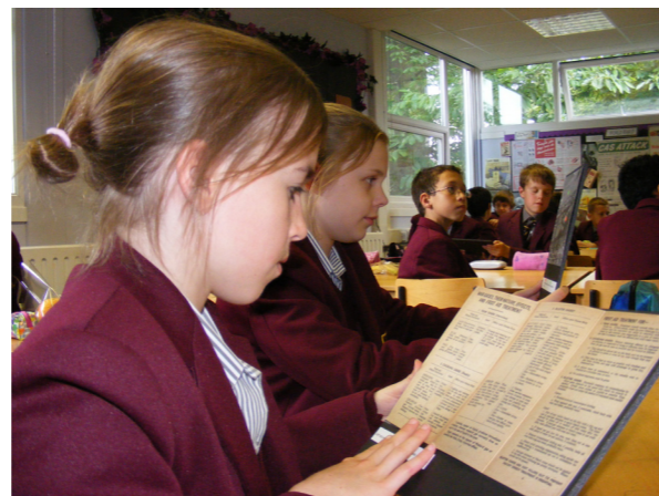
Pictured above are members of Year 6 looking at wartime information leaflets on air raid precautions.