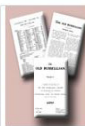
The Old Russellian